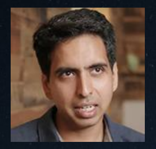
Teachers dedicated to improving lives