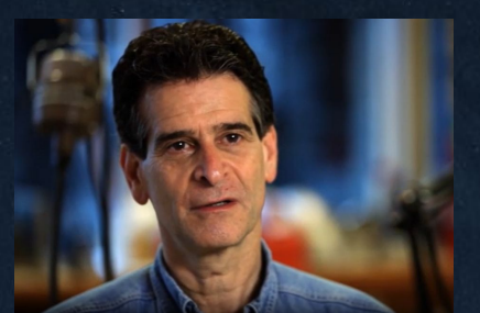
creative people in the arts, science, and technology