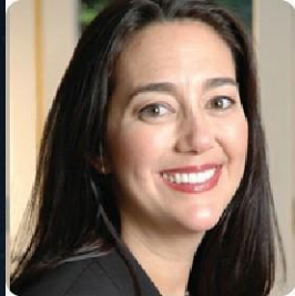
Teachers dedicated to improving lives