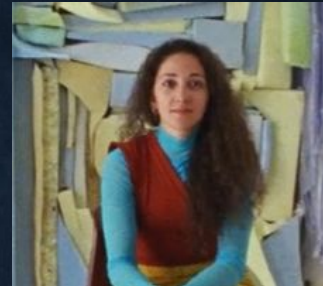
creative people in the arts, science, and technology