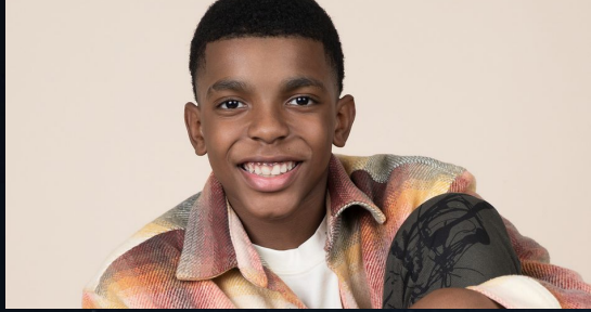
Children who inspire us