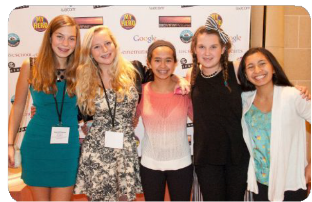
Filmmakers Santa Barbara Team Press